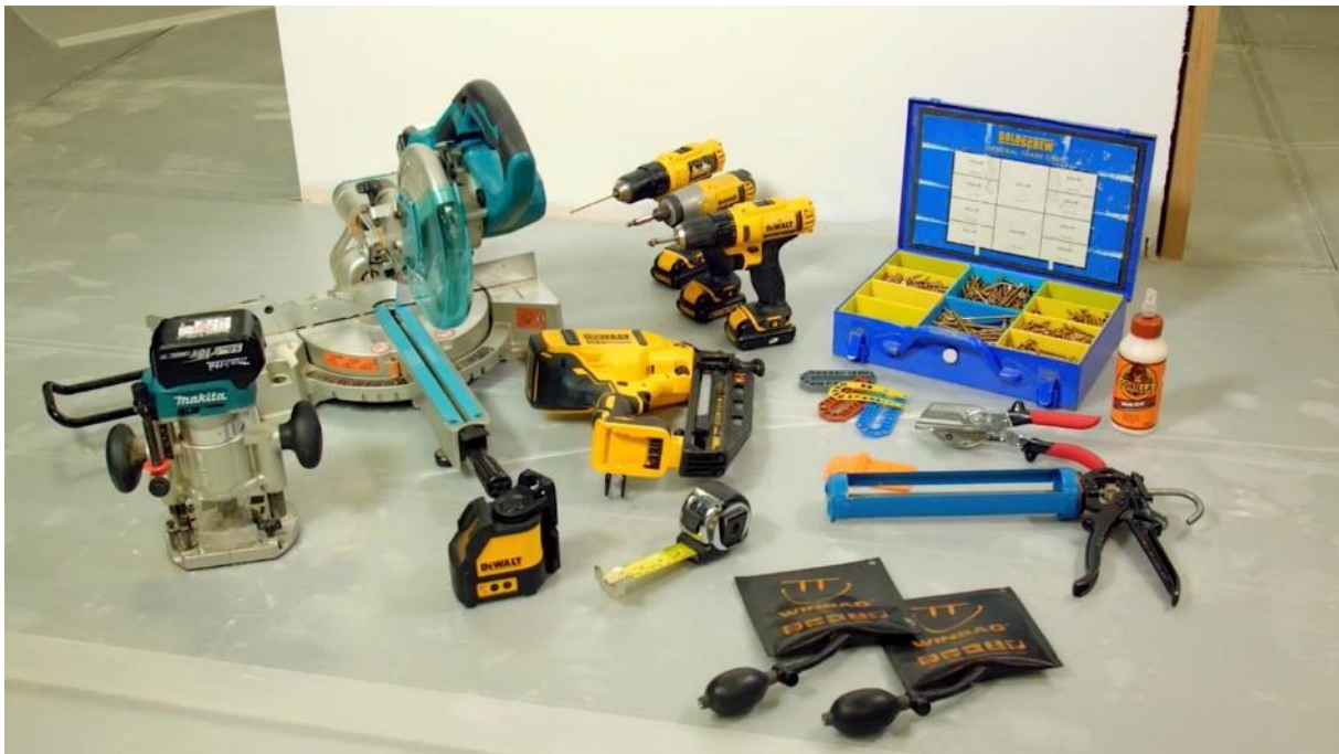
Figure 3: Section of tools required to fit a FD30 door.

To insure the correct installation of the door please follow the instruction at https://www.forza-doors.com/media/168306/forza_za_door_installation_guide_fd30-60_pdf.pdf