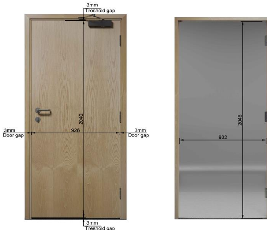
Figure 1: Dimensions of door and required door frame

commonly purchased sizes in the UK and it is a common size used by other manufacturers across Europe. Data would not be available on the installation of the door if the sizes in the EN17213 were reported on.