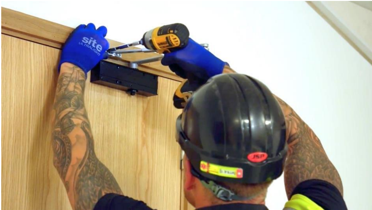
Figure 6: Generic example of installing ironmongery