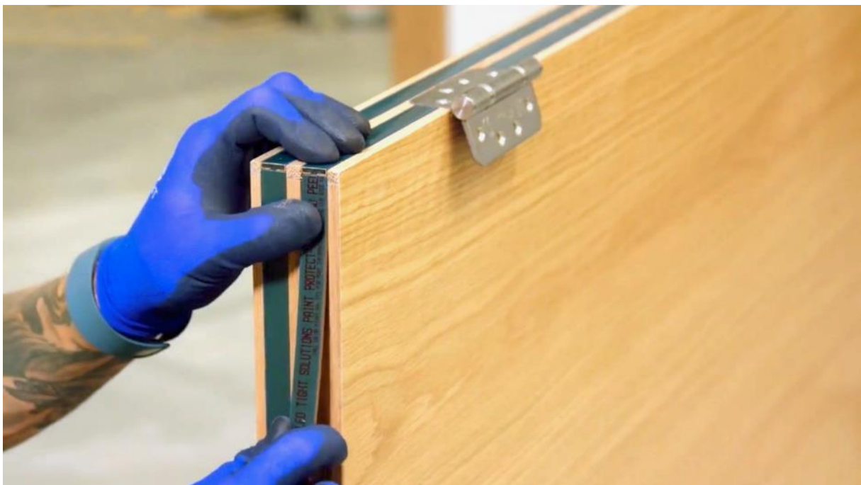
Figure 5: Generic example of fitting intumescent strip