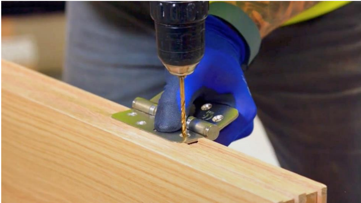
Figure 4: Generic example of fitting the hinges