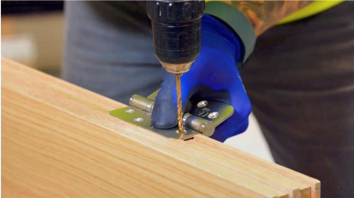
Figure 4: Generic example of fitting the hinges