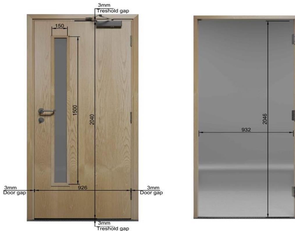
Figure 1: Dimensions of door and required door frame

ironmongery such as door handles, hinges and closures. The size chosen is one of the most commonly purchased sizes in the UK and it is a common size used by other manufacturers across Europe. Data would not be available on the installation of the door if the sizes in the EN17213 were reported on.